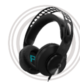
Legion H300 Stereo Gaming Headset