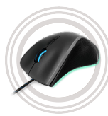
Lenovo Legion M500 RGB Gaming Mouse