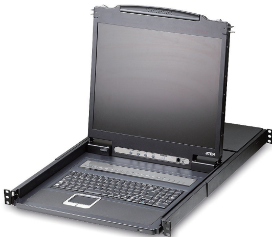
CL1316 Front view