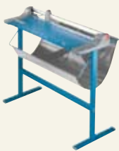
Optional features 00798 Stand