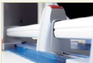
Circular blade in plastic head