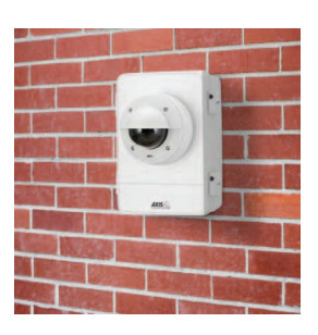
AXIS T98A17-VE Surveillance Cabinet