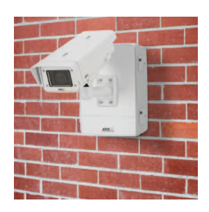
AXIS T98A16-VE Surveillance Cabinet