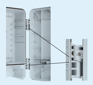
Hinge stop at 105°