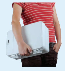
Lightweight polycarbonate surveillance cabinet