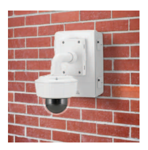
AXIS T98A18-VE Surveillance Cabinet