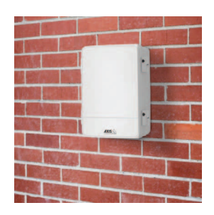
AXIS T98A15-VE Surveillance Cabinet