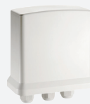
POS-4001 Outdoor High Power PoE Splitter (12V)