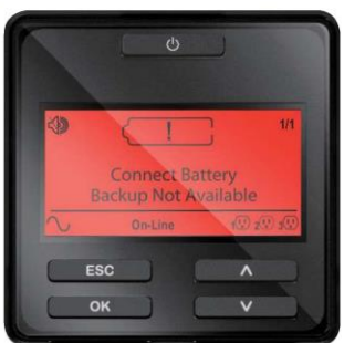
Red: Indication of UPS alarm that requires immediate attention