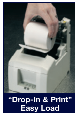
"Drop-In & Print" Easy Load