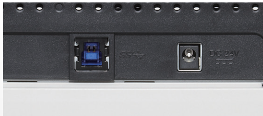
High speed performance through USB 3.0 interface

All four scanner models additionally make use of an ultrasonic sensor that accurately detects multifeed errors where two or more sheets are fed through the scanner at once plus intelligent multifeed function that is designed for documents that intentionally feature paper attachments of defined sizes or locations such as sticky notes or photos. The scanner can automatically recognise the location of the attachment and will then exclude that zone from triggering alert conditions.