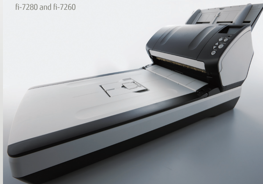
fi-7280 and fi-7260

Carrier sheets allow you to scan documents, larger than A4 or photos and clippings that are at risk of being damaged when processed through an ADF. {Part Number – PA03360-0013}